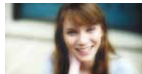
NEW Orton Effect