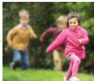
Depth of Field