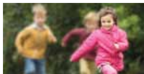
NEW Depth of Field