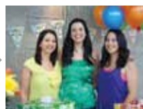
Create great group shots.