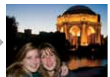
Create perfectly lit shots.