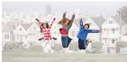
NEW Simply paint on 1 of 100 effects, including 30 new options, to enhance areas of your photos.

* For a full list, visit www.adobe.com/go/pse_reviews .