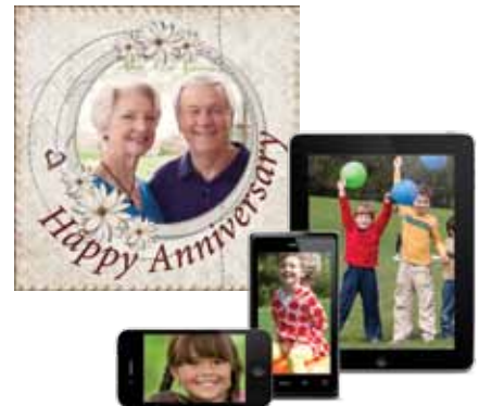
Mobile access via Photoshop.com †