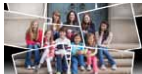
NEW Picture Stack