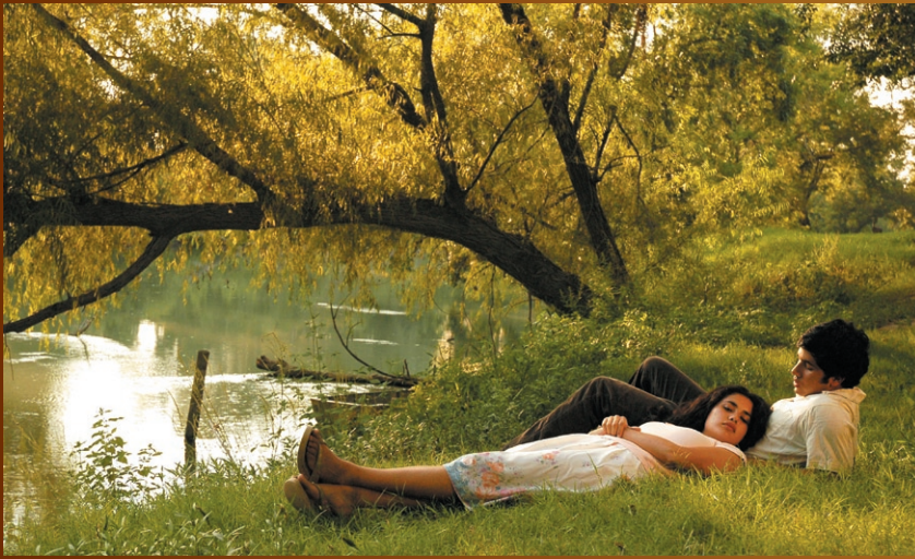
August Evening features rich, vibrant HD footage assembled using Adobe Premiere Pro software.