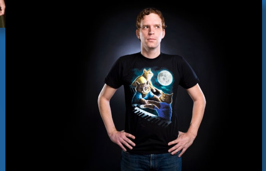
Three Keyboard Cat Moon by Oxen

"Adobe Illustrator and Photoshop CS4 are my life. I use them every day."