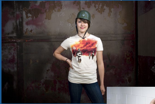
Art No War by Noah Krogh